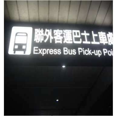
The express bus pick up sign at Tao Yuan international airport.

came out this month and it was subbed. I was seriously smiling and grinning with sheer happiness with the fact that I was going watch the ultimate ending of my prolonged drama. After a good 3 hours, I pretty much fell asleep the rest of the way, without feeling air sickness. It was a BREEZE.