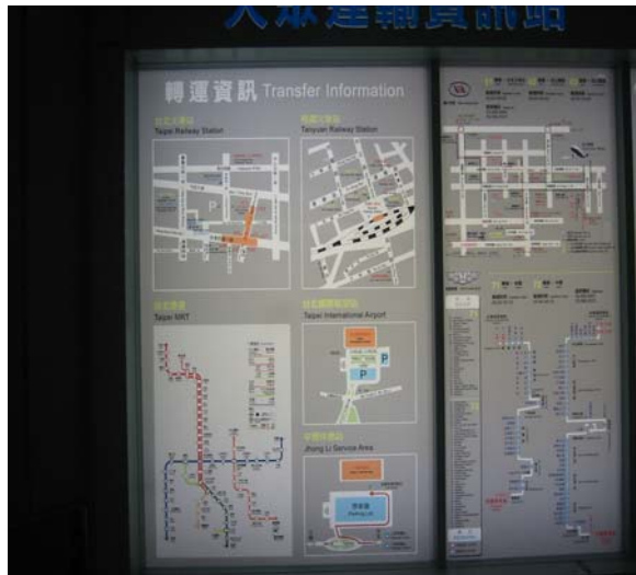
The Tao Yuan international airport had this large board

Our first day to Taiwan was comprise of mainly the plane ride (14hrs). Unlike most tour travels, our group came to Taiwan in different times as well as differing airlines. Although we did arrive differently, we all agree that the 14