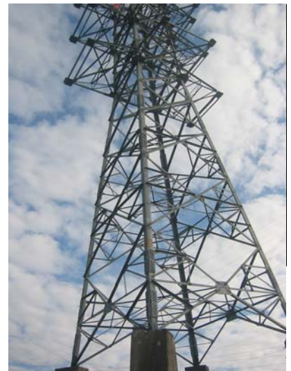
An electric tower that moved during an earthquake—but no longer works.. It now stands as a memorial .