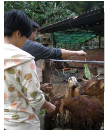
Feeding goats and rams