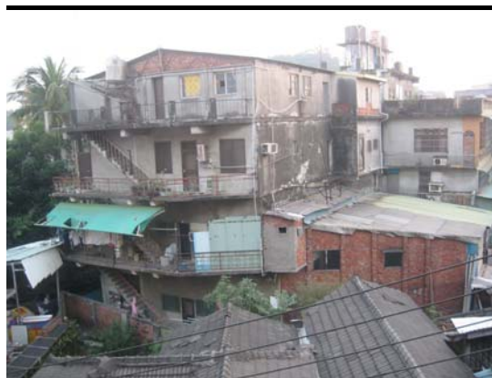
A small view of small and old homes awesomely cluttered together.