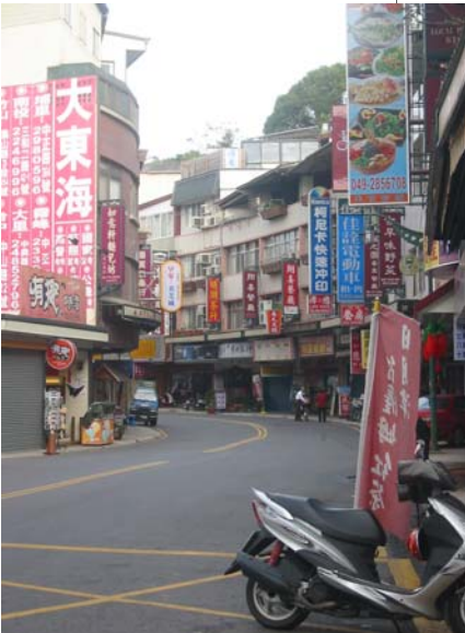
Setting area around Del Lago.