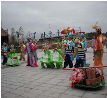
A traditional Taiwan wedding