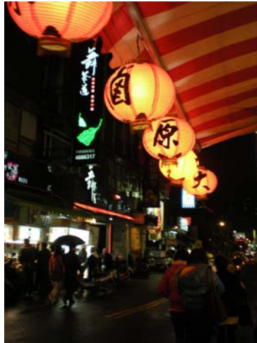
Outside one night in Taiwan.