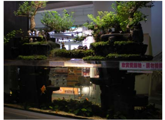
A cool fish tank at a shopping area