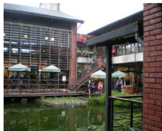
The food court of the Chinese art center.

to Taipei. while riding on the bus, we watched an interesting Asian movie that half us couldn't understand because there were only Chinese lyrics and no sound. We finished the movie just in time when we arrived at Taipei, and we went our separate ways. We all left in different directions, but we already said our hugs and goodbyes. We weren't really that sad, though because we all lived pretty close and we would be meeting again, anyways. And that concludes our adventure and our exciting memories of traveling all around Taiwan.