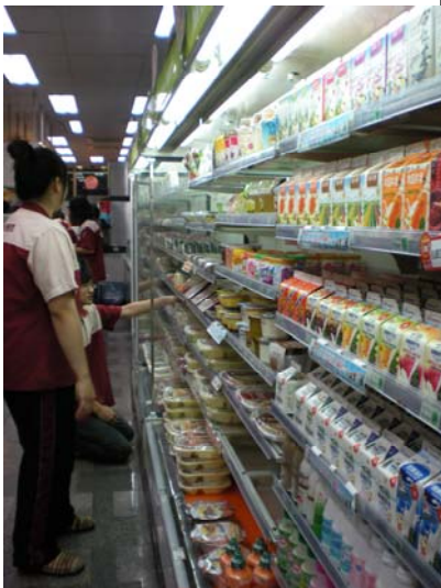
A convenience store located in a train station.