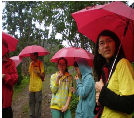
Raining, we picked out some sweet and sour cumquats.

got to see newborn baby sheep (goats?), pigs, and birds of all varieties, including peacocks. After we were done