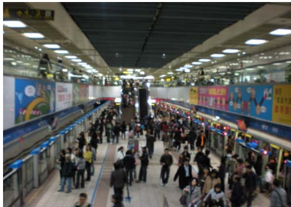
The subway with many people