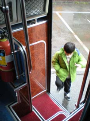
A boy coming onto the bus